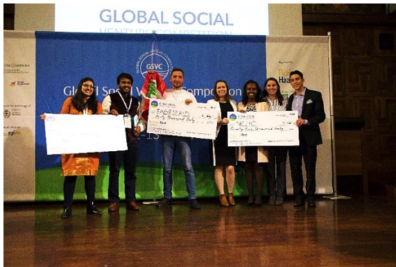
GSVC Global Final 2018. Milan, Italy.