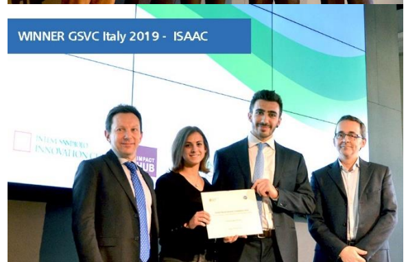
GSVC Italian Round finals 2019. Milan, Italy.