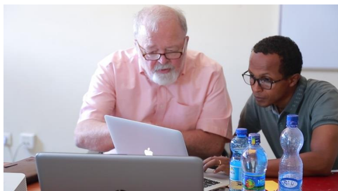
MBA student in Ethiopia during a coaching session

Within the Accelerator project, E4Impact also supported the SPARKme Acceleration Programme launched by Openet Technologies , a telecommunication company based in Matera (Basilicata, southern Italy). It was aimed at establishing two Technological Accelerators in Matera (Italy) and in Nairobi (Kenya).