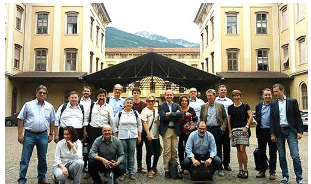
The SEBRAE RS delegation visits Trentino Sviluppo, the local agency for the development of the Trentino Region (2018).