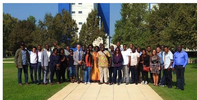
Business Networking Week in Italy, September 2018.

24 of our MBA students from all over Africa came to Milan for a week of workshops, events and meetings.